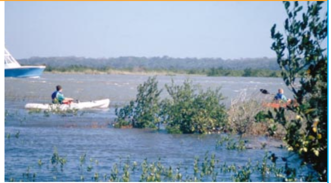
Access to water recreation draws sports enthusiasts.