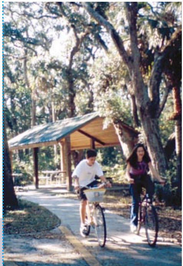
A bike path offers alternative transportation for residents and visitors (right). A beachside boardwalk beckons visitors (opposite top). Near Beverly Beach and Flagler Beach visitors enjoy six miles of beach overlook (opposite bottom).

VALUING THE RESOURCE. What started as a project to develop a master plan to protect and preserve an endangered maritime tree canopy found adjacent to the roadway in 1998, eventually led to the funding and development of a corridor management plan (CMP) and state designation as a scenic highway in 2001. Included in the CMP was the need for an Overlay Zoning District (OZD) to implement supplementary development standards for both Flagler County and the town of Marineland.