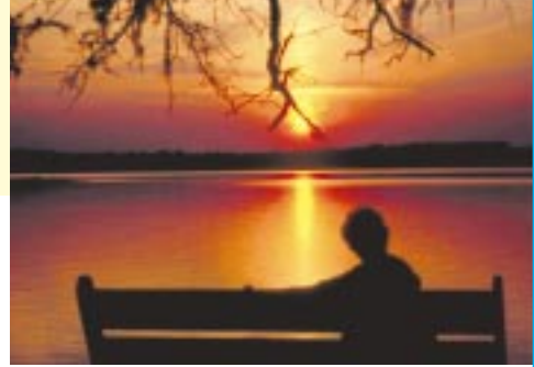
Time for reflection along the A1A.

This project was successful because of a number of factors. Is your byway implementing similar best practices?